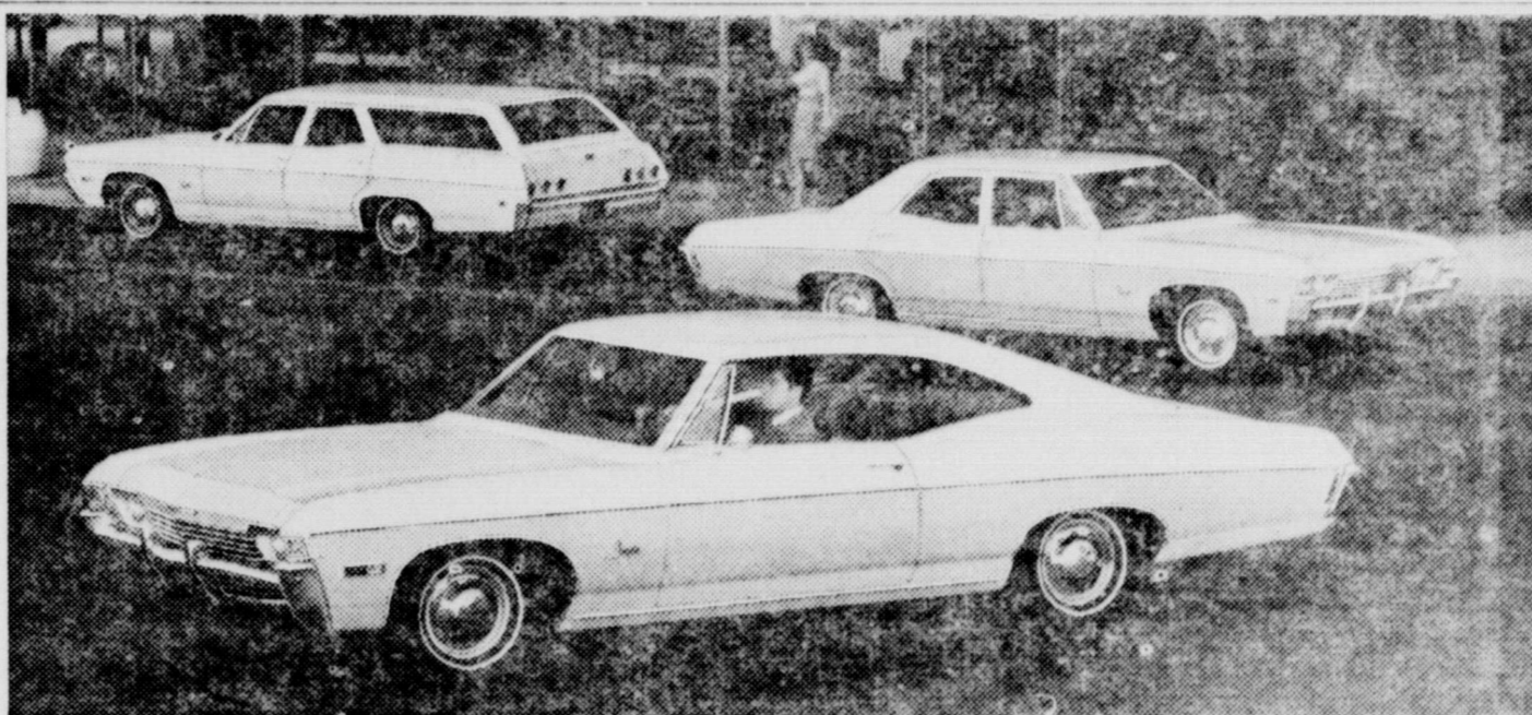
Impala Sport Coupe (foreground), 4-Door Sedan, Station Wagon

in Dallas attending the Christian Church convention. He was presiding officer at the opening session of the convention.