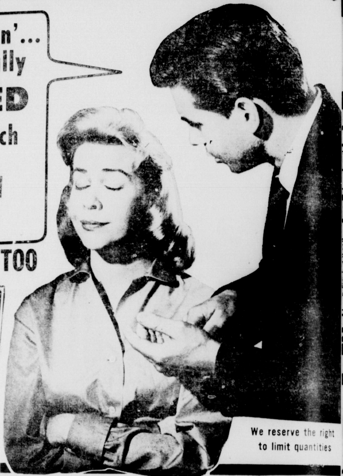
We reserve the right to limit quantities

No kiddin'... You really SAVED that much at MARTIN JONES?