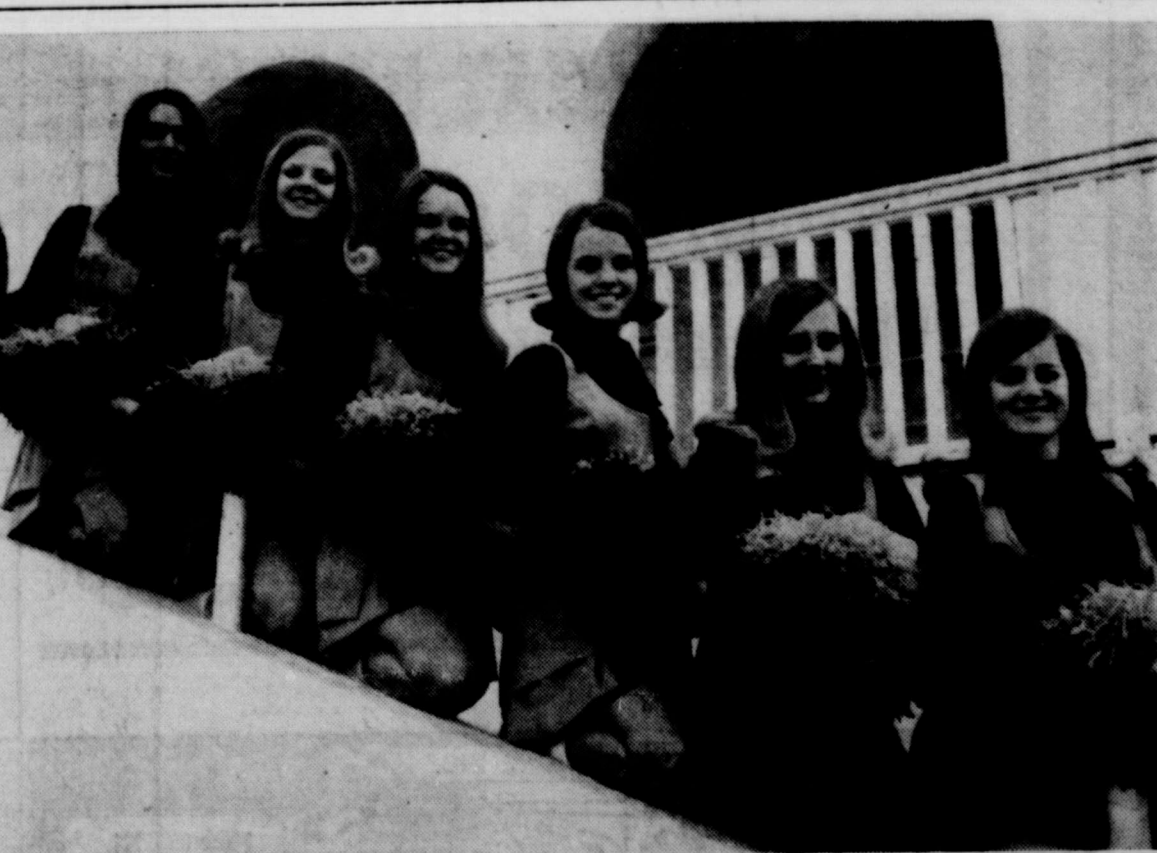
C. H. S. CHEERLEADERS-Pictured above are six Crowell High School cheerleaders for the current school term. From the left, they