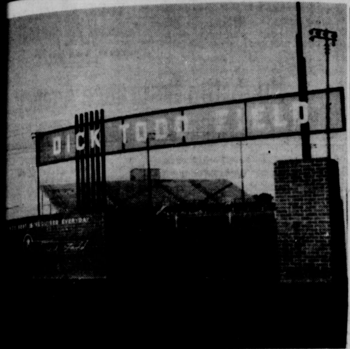
CK TODD FIELD ENTRANCE-Show in the above picture new entrance recently completed at the local football and dedicated in appropriate ceremonies Friday night, (News photo)