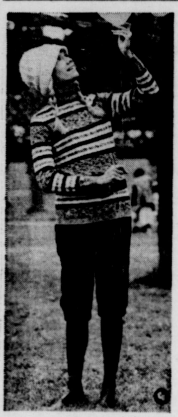
SASSY - Cotton corduray knickers, punctuated with galosh fasteners, accent the leggy look. The put-on's a classic turtleneck sweater in a marled rib. By Koret of California.