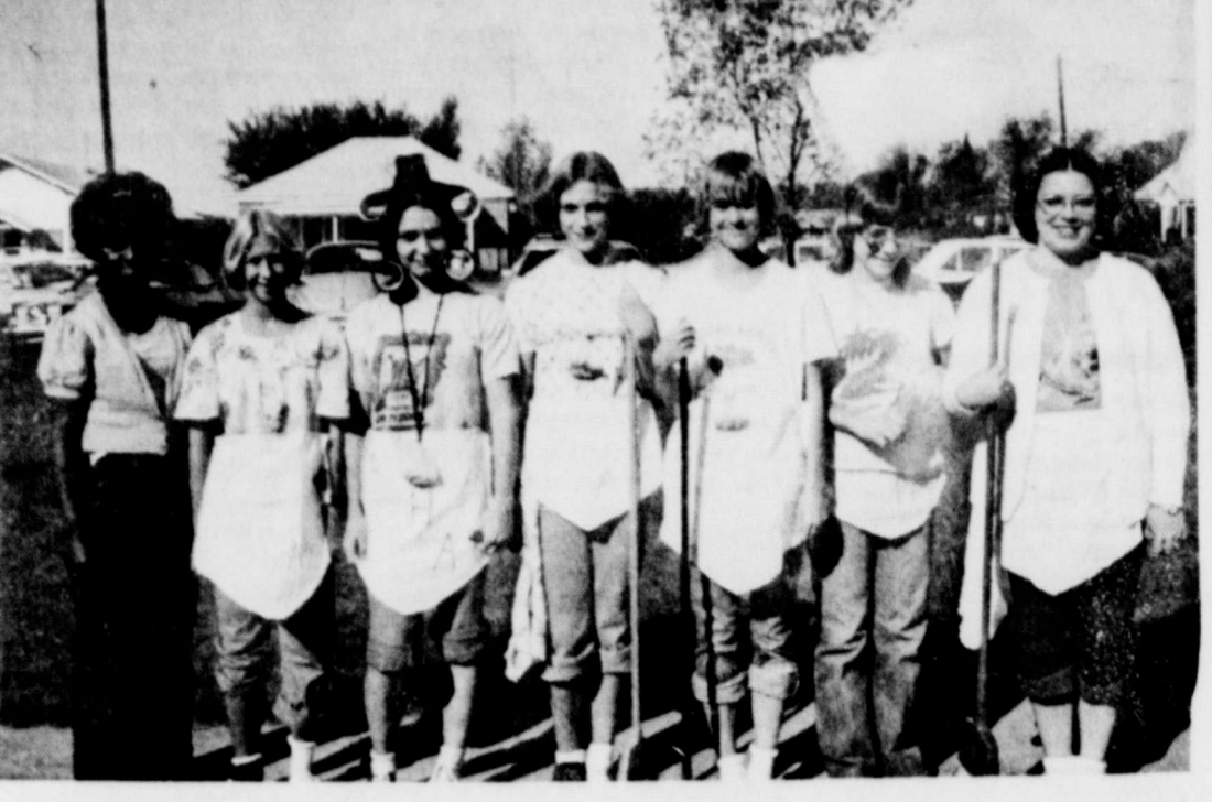
among freshmen girls who were initiated into the Future Homemakers of America organization Wednesday of last week. From