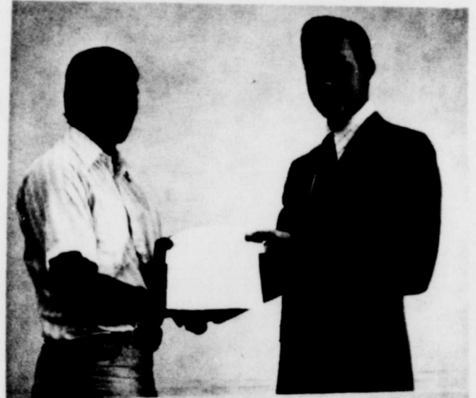
AREA IV FFA CONTEST

hospital, which takes about $20,000 per month to operate, is in sound financial condition and is presently paying its way.