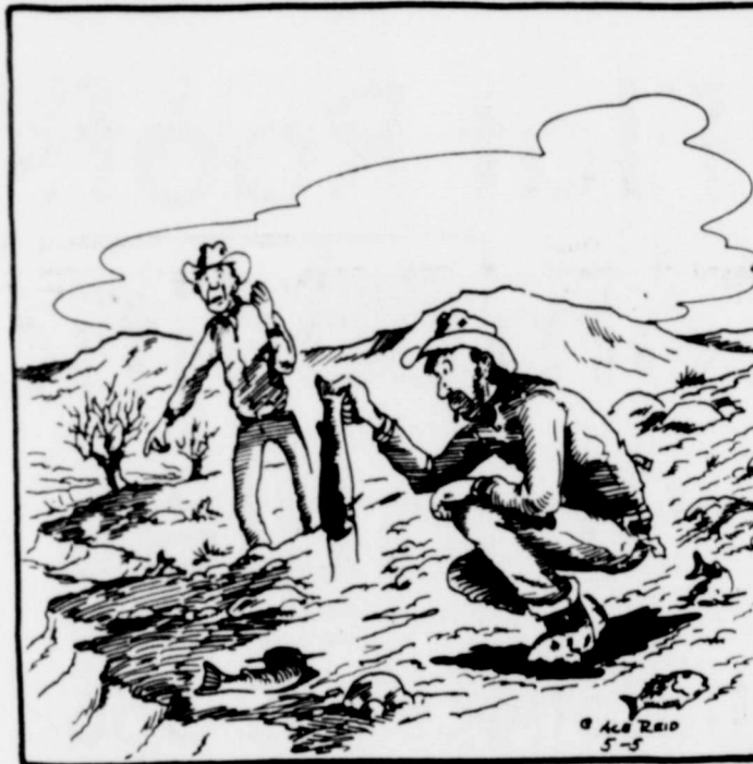
"I reckon they jist down... its been so long since they've seen rain or high water."