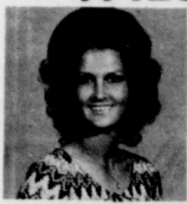
By BRENDA AND SUE CROWSON