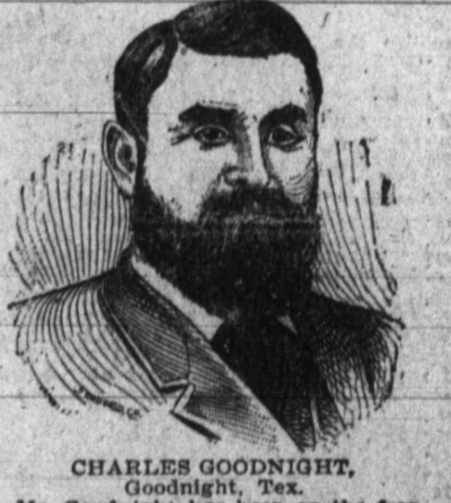
CHARLES GOODNIGHT, Goodnight, Tex.

Every man interested in raising cattle, horses or hogs should be familiar with the line of breeding that is true to itself.