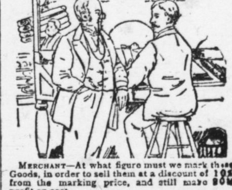
MERCHANT—At what figure must we mark these Goods, in order to sell them at a discount of 20% profit on cost? The marking price must be 1 1/4 times the cost price, according to Ropp's Discount Table No. 4.