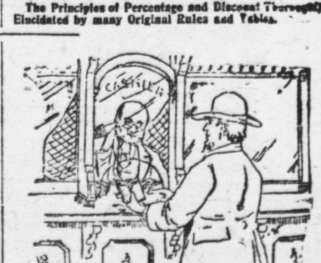
FARMER—I wish to borrow $500 for 90 days. I'll pay the $9.00, interest next Saturday, as I must have even $500 today.