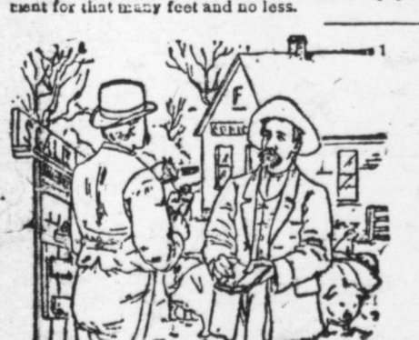
Stock Shippers—The net weight of your lot of 4,425 lbs. and at $3.75 per cwt., amounting to $155.69. Here is your check, and I have paid you $155.69. There is an error somewhere. I see it. Ropp's Calculator (page 6) that the amount is $145.74.