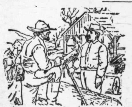
Sawyer—Your walnut log measures 24 inches in diameter and 16 feet in length, which according to Scribner's or Boyer's Tables will make 400 feet of lumber.

The number of bushels and pounds in a load of wheat, corn, rye, oats or barley, and the correct amount for same, at any price per bushel. The exact amount for a lot of hogs or cattle, from 1 lb. to a carload, at any per cent. The correct amount for a load of hay, straw, coal or coke, from 25 cents to $20 per ton.