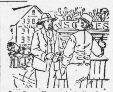
GRAIN BUYER—The top price for No. 3 corn today is 38c. Your lot weighs 3180 lbs. net. Take a seat while I am figuring it out.

And mail at once to The Texas Stockman-Journal, Fort Worth, Texas