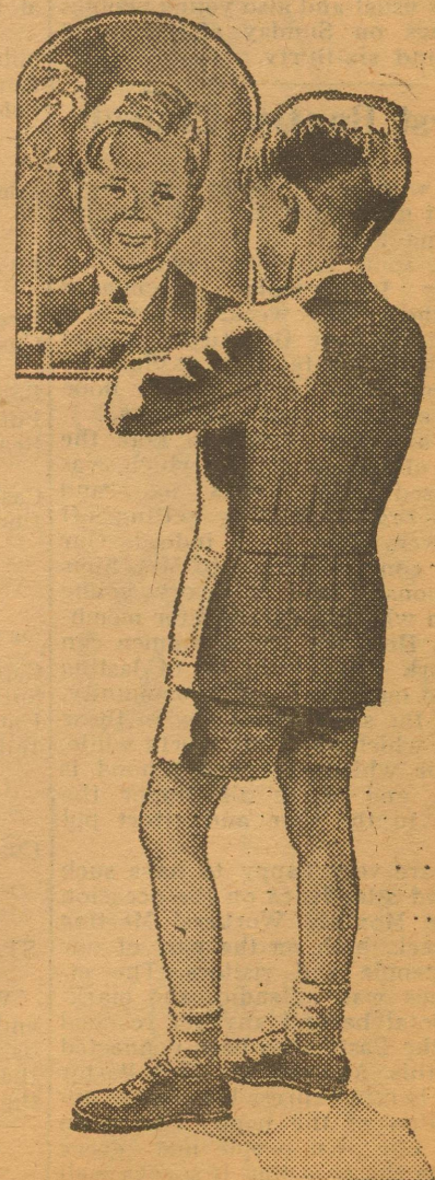
Ages 3 to 12 years