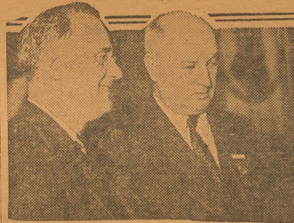
PRESIDENT F. D. ROOSEVELT P-M GENERAL JAS. A. FARLEY