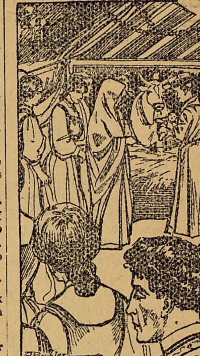
"Oh, yes; I can just tell you! we had a high old time at Tahoka on the 4th." —Returned Brownfielder.