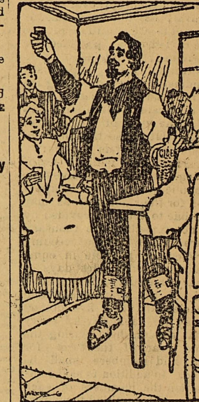
That you all enjoyed the Fourth, and that you may live to see many more.