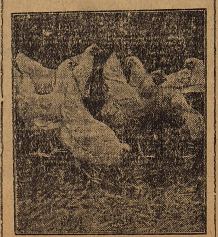
WHITE WYANDOTTES, DOUBLE COMB. feathers. Wyandotte pinfeathers, be-

dottes have decided in favor of them. "Other breeds did splendidly at times, but after averaging up year after year and for all purposes combined I found nothing to equal White Wyandottes. The birds are of blocky shape and tender flesh, making the finest of broilers and roasters, and are fit for market as broilers at an earlier age than nearly any other breed, putting on flesh from the start, while other breeds are growing an abundance of