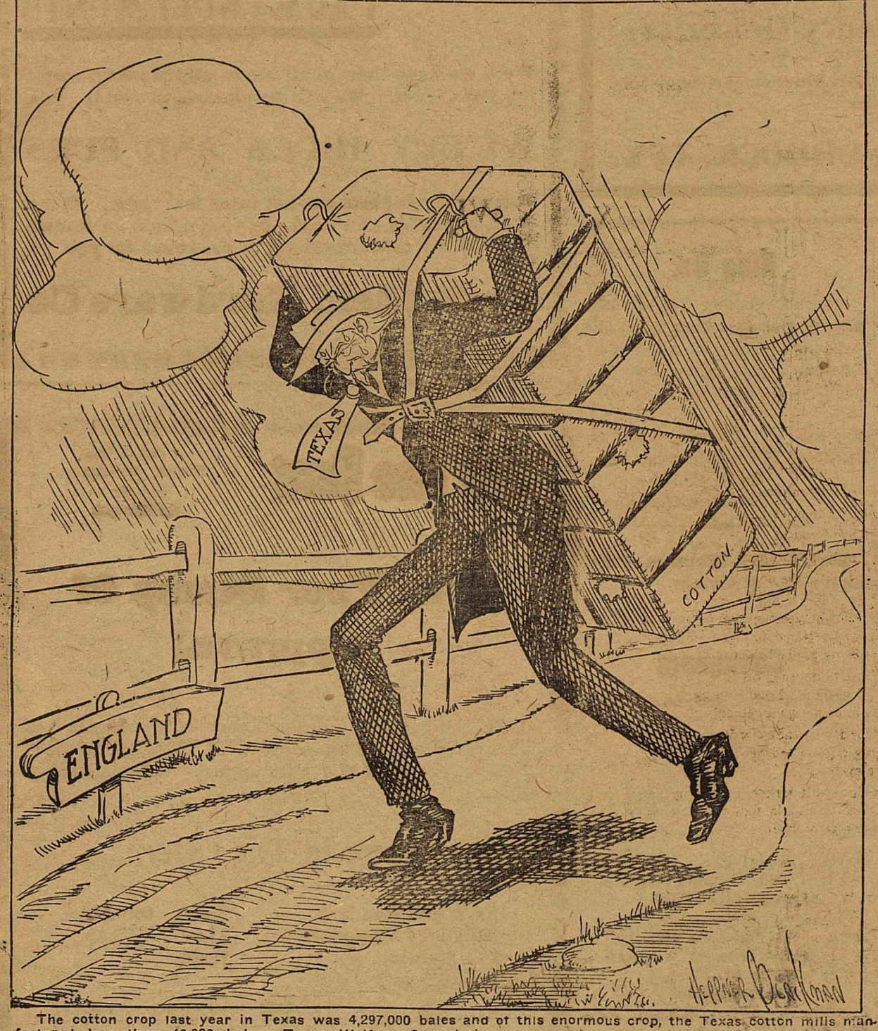
The cotton crop last year in Texas was 4,297,000 bales and of this enormous crop, the Texas cotton mills manifactured less than 40,000 bales.—Texas Welfare Commission.