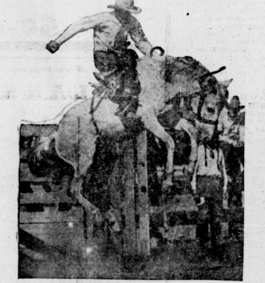
About the next jump and cowboy and horse will part company. It is one of the thrills of the rodeo world, being featured this year by the world-wide Will Rogers Memorial rodeo to be conducted Sept. 4, 5 and 6, by the Pike's Peak Polo association on the Broadmoor hotel polo grounds in Colorado Springs, Colo. At the same time the Will Rogers Shrine of the Sun, half a mile above the rodeo grounds on Cheyenne mountain, will be formally dedicated.