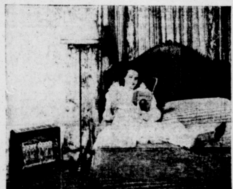
This sample heating photo illustrates a radiant circulating type gas heater in the home of one of our customers.

A prize of $10 will be awarded EACH of the TEN BEST PHOTOS submitted each week. At the close of the TEN WEEK PHOTO CONTEST four additional grand prizes of $100, $75, $50 and $25 will be awarded the four best photos submitted.