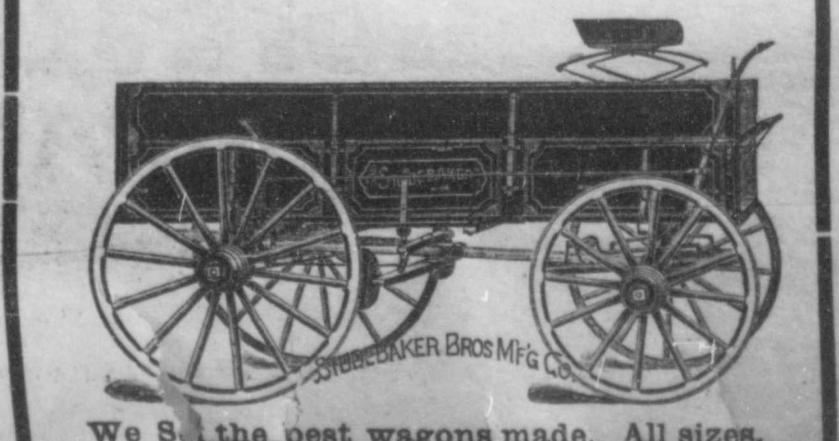
We sell the best wagons made. All sizes.

And the prize goes to the little girl 14 years of age, or under, who forms the best jingle. Each jingle must be short and must contain either Buck's Stoves or Buck's Ranges, or just Buck's, or Henry Martin, or Martin's. Now girl's, get to work and work hard.