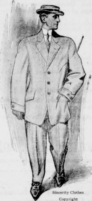
Sincerity Clothes Copyright

Some of the Most Charming Creations Range from $3 to 7.50 in Price