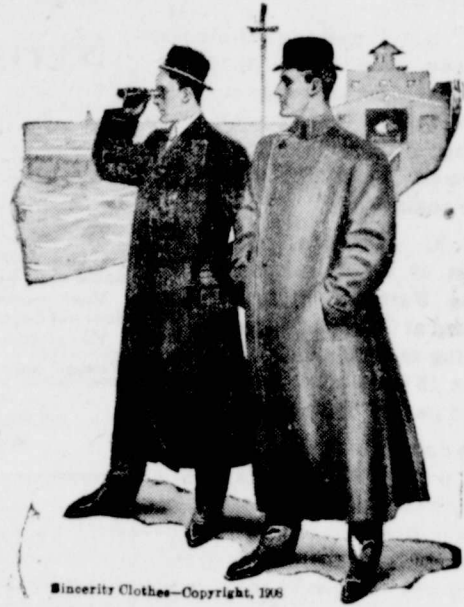
Sincerity Clothes—Copyright, 1906