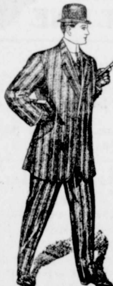
Fashion No. 590 Two-Button Novelty Sack

A MAN'S suit contains 228 separate pieces of material. Doesn't that impress upon you the importance of having your clothes made expressly for you—