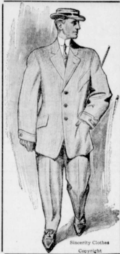
Sincerity Clothes Copyright

UNTIL half the season is gone before getting New Clothes. You know that you need some new clothes and also that you are going to get them soon. Then, why wait? You might as well be wearing them now instead of going around in that seedy-looking summer outfit. By buying your clothes early you get the full season's wear out of them and have the advantage of picking out your suit while the stock is complete. Our "SINCERITY" clothes for this season are (if possible) even Better and Prettier than ever before.