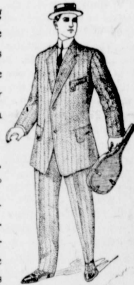
Fashion 643 Two-Button Novelty Sack

Ed. V. Price & Co. MERCHANT TAILORS CHICAGO