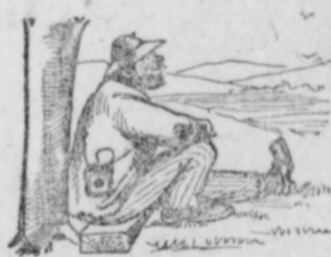
An Exclusive Consumer.

The producer is interested in producing all he can and getting as high prices for his products as he can. The consumer is interested in consuming as little as he can and buying it as cheaply as he can. The tramp is the highest type of an exclusive consumer.