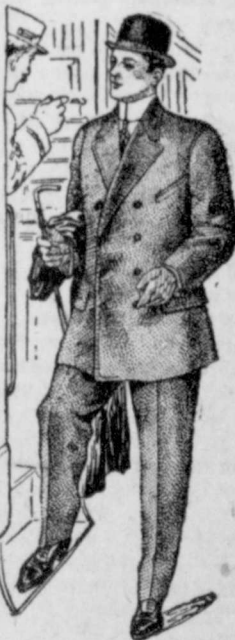
Fashion No. 683 Four-Button D.-B. Sack Soft Roll

make your Fall clothes, we give you our word, as their local representative, that satisfaction will be yours or you don't have to accept the goods. While the Woolens are distinctly exclusive, the prices are lower than ordinarily obtain.