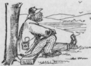
An Exclusive Consumer.

The producer is interested in producing all he can and getting as high prices for his products as he can. The consumer is interested in consuming as little as he can and buying it as cheaply as he can. The tramp is the highest type of an exclusive consumer.