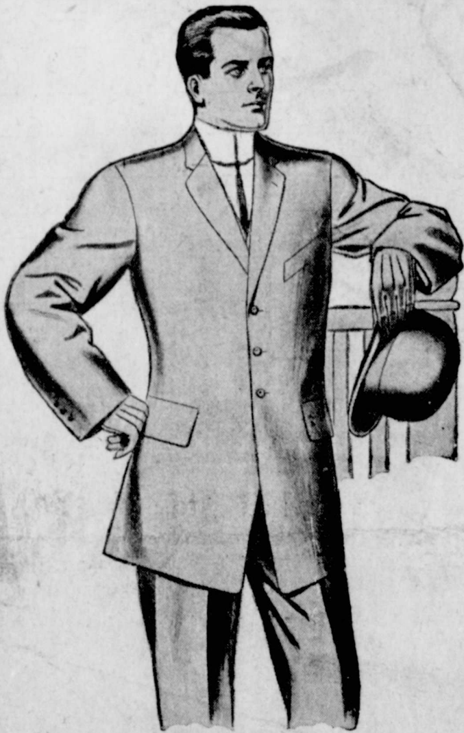
DESIGNED BY SPERO, MICHAEL & SON NEW YORK