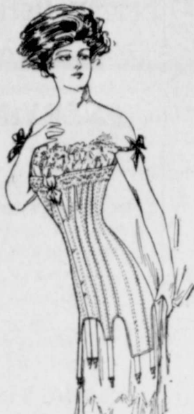
AMERICAN BEAUTY Style 1638 Kalamazoo Corset Co., Makers