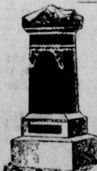
Figure with me when in need of anything in my line. I am in position to save you money on anything in my line. All I ask is a chance. I guarantee my work and will remain here to back my guarantee. See my New Designs before placing an order.