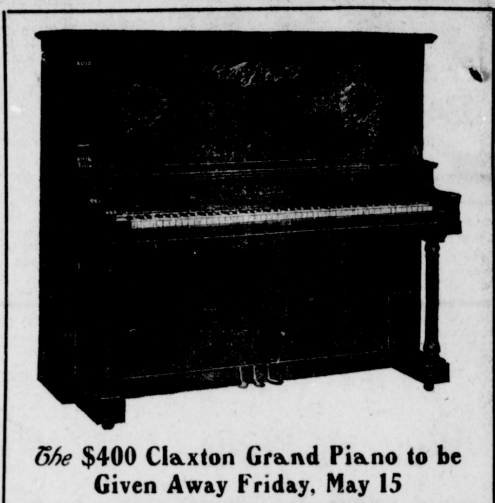
The $400 Claxton Grand Piano to be Given Away Friday, May 15

Any of the prizes is well worth your time and trouble to work for, and the beauty of it all is—it don't cost you one cent— ABSOLUTELY FREE to you. Only a little exertion on your part at the proper time to buy the things you need and to induce your friends to buy what they require. Each one of you try and see how many of your friends you can induce to come Wednesday and Saturday of each week and get 5000 extra votes on the dollar and give you the votes. The goods will not cost them any more. On the other hand, we pride ourselves on selling the Best Merchandise that you can find anywhere at as low a price—a little lower, we think, than you can find elsewhere, because our goods are marked at Cash Prices. Remember that TODAY (Saturday) Gingham, Curtain Goods, Laces and Embroideries are on Sale and we will give 5000 Extra Votes on the $.