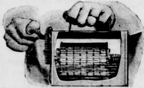
Showing the quick and simple manner of washing the skimming device with the Mechanical Washer.

First.—The smooth curved blades of the skimming sections form narrow, circular "runways" through which a tremendous current of water rushes when the sections are rotated (in same direction as the blades curve), by the Mechanical Washer (Centrifugal force does this cleaning largely); thus are all the surfaces scrubbed perfectly.