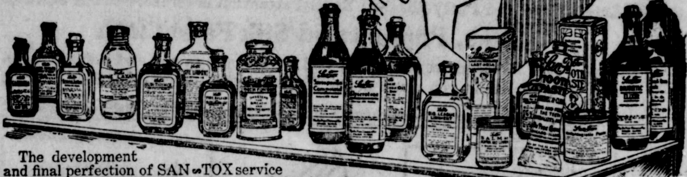
The Sign of the Nurse Points Out the SAN-TOX Druggists

The development and final perfection of SAN-TOX service to the Public is epochal in the history of the American drug store. It marks a new departure in the scope of service which is now possible for a druggist to render the public—service which, however, can be rendered only by SAN-TOX druggists.