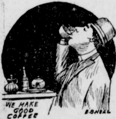
WE MAKE GOOD COFFEE

SAN-TOX Liquid Green Soap an absolutely pure article delicately scented, unsurpassed as a shampoo lathering freely and leaving the hair soft and fluffy. Get it at Miller's Drug and Jewelry Store. (adv.)