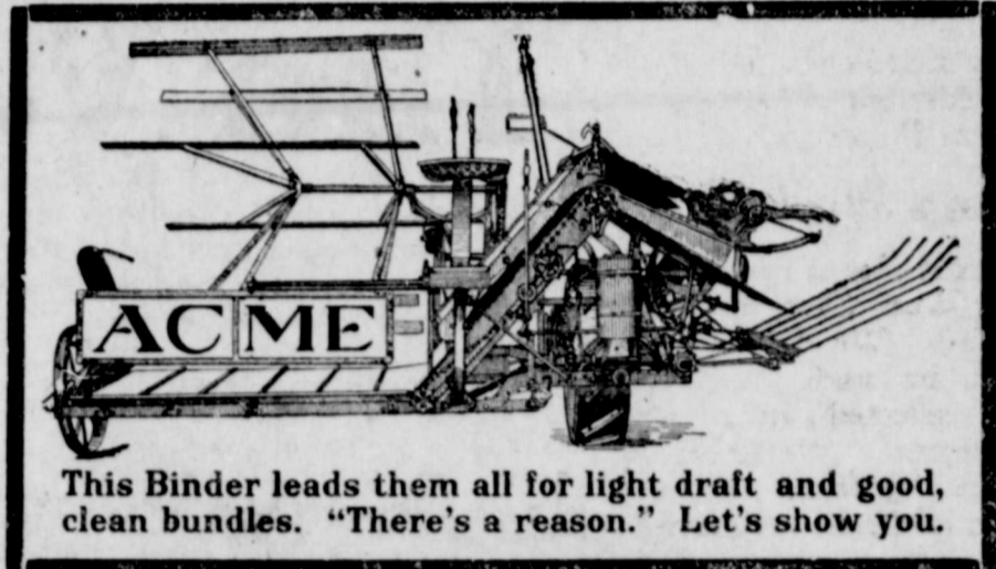
This Binder leads them all for light draft and good, clean bundles. "There's a reason." Let's show you.

See our Oil Stoves before you buy. We guarantee them.