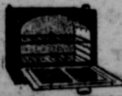
Florence Glass Door Oven, rust proof with arched roof

You can have a slow, simmering fire on one burner and at the same time a quick, hot fire on another. Just set the levers as you want them—and the same heat will be given as long as you wish. All Florence Stoves and Ovens are guaranteed.