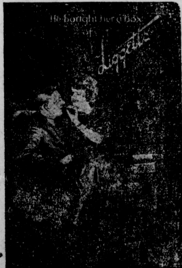
Get It At CLEMENTS' DRUG & JEWELRY STORE "The Rexall Store."

Be sure to call and see us as it will be to your advantage