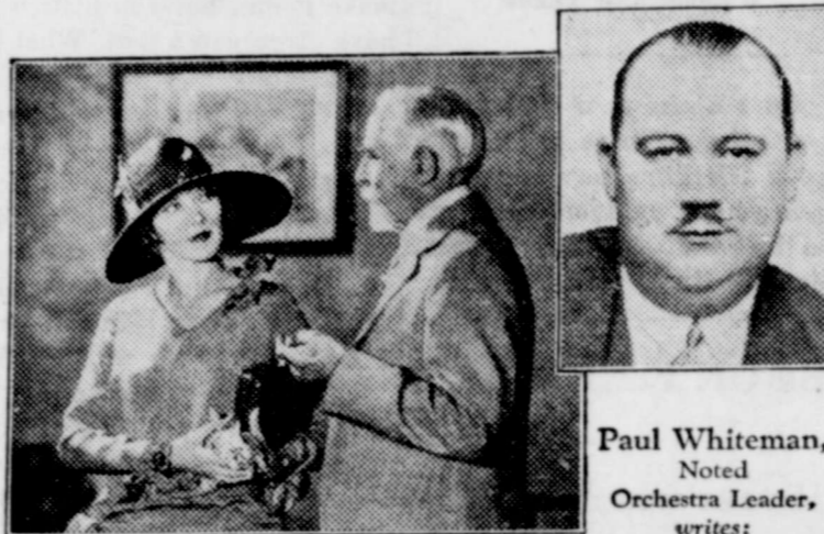
Paul Whiteman, Noted Orchestra Leader, writes: