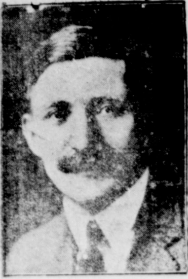
W. S. KNUDSEN President & General Manager Chevrolet Motor Co.

DETROIT, Dec. 24—Promising the most spectacular low priced automobile of all time, the Chevrolet Motor Company announced here today that a complete new line of motor cars will be introduced to the public January first.