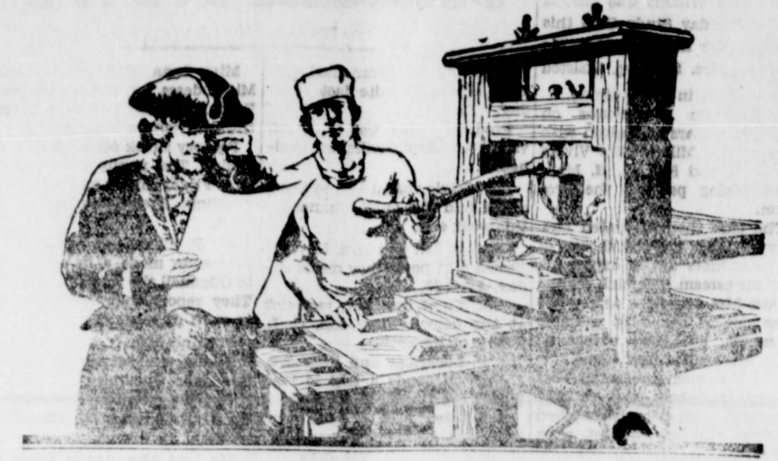
See Editorial, "America's First Economist."