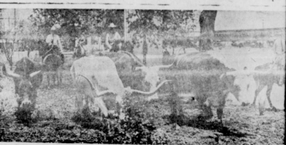
nghorn steer which broke many trails to Southwestern markets in the early da hisholm Trail" are pictured here being driven by Texas Rangers on one of