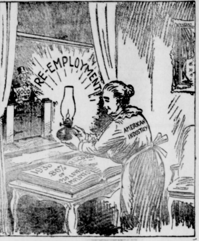
Read Editorial, "Employment Increasing."