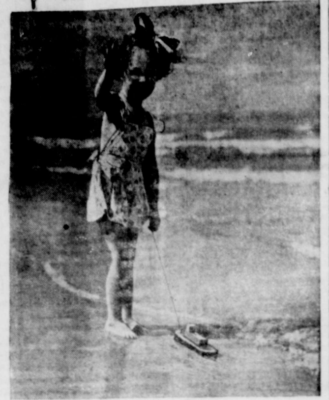
The photographer, fairly close, took care to focus on the child, not on the

THOSNAPSHOT GUILDA SERMON TO VACATIONERS