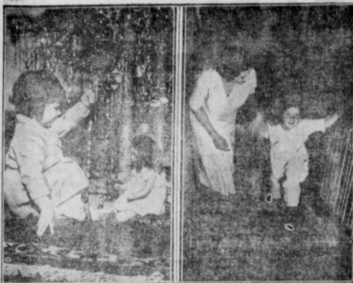
Let pictures tell the story. Bedtime on Christmas Eve is as important to the story as discoveries at the tree next morning. Amateur flood or flash lamps and supersensitive film put the pictures on a snapshot basis.

PLANNING our Christmas pictures is very much like planning our Christmas shopping. Far in advance we resolve to do it early. Day after day we resolve to do it early. And then all of a sudden the time is up, we can't do it early—and we don't do it well.