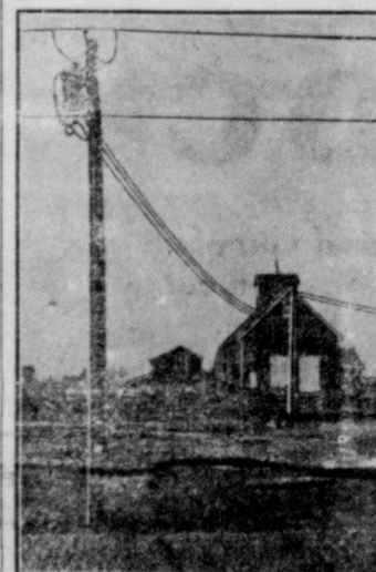
Ties high line is the life line of some 1,300,000 American farms.

I farmers also thresh their own grain, using a portable motor to driv