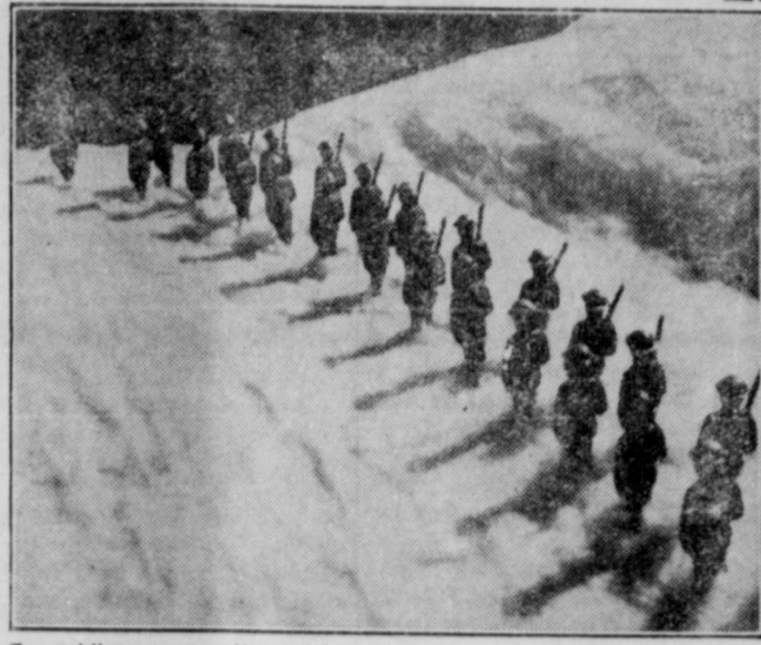
Foy soldiers, some cotton batting—and you have a war picture in winter, Making table-top pictures is easy, and fun.