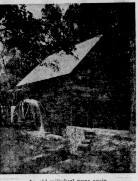
An old millwheel turns again