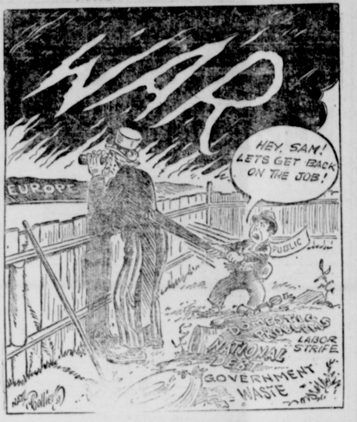
Now that the European War has shaken See Editorial, "OUR OWN BACK YARD'

jure a small animal such as a each time a maintenance crew ture's danger signal, because sent a steady stream of detours. call me names, they threaten to kill