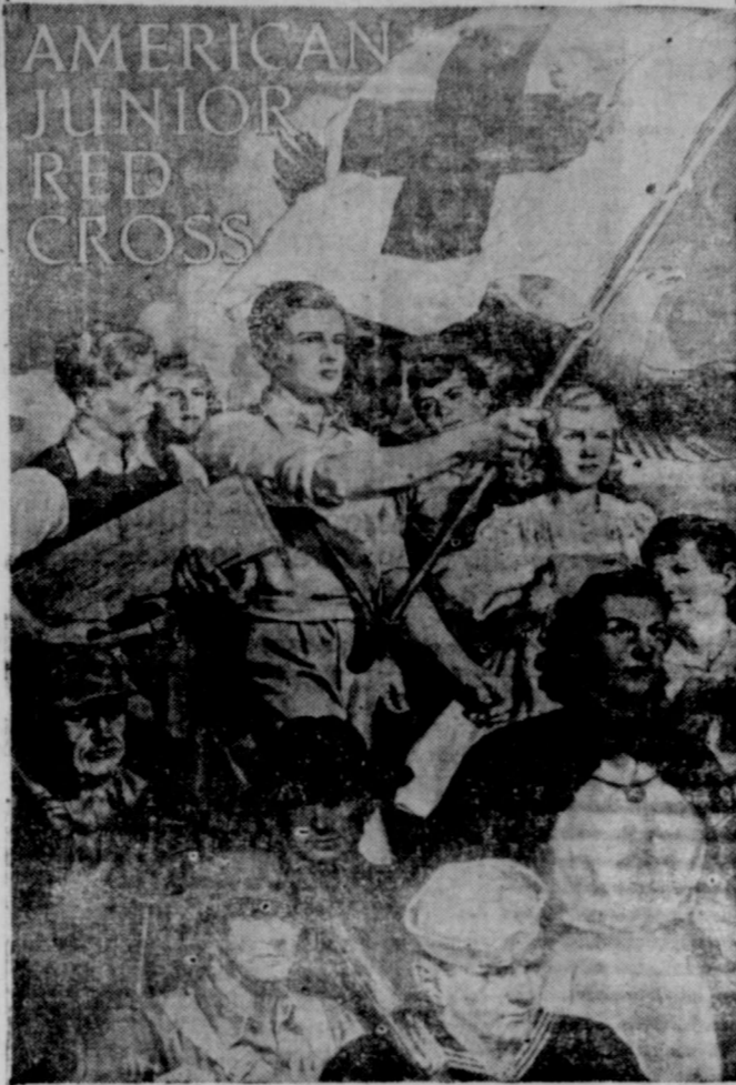
Symbolic of youth's part in the war effort, this new poster was painted for the American Junior Red Cross by Walter Beach Humphrey, noted artist. The Junior Red Cross—14,000,000 strong in the schools of the nation—will conduct its annual Enrollment for Service campaign from November 1 to 15.