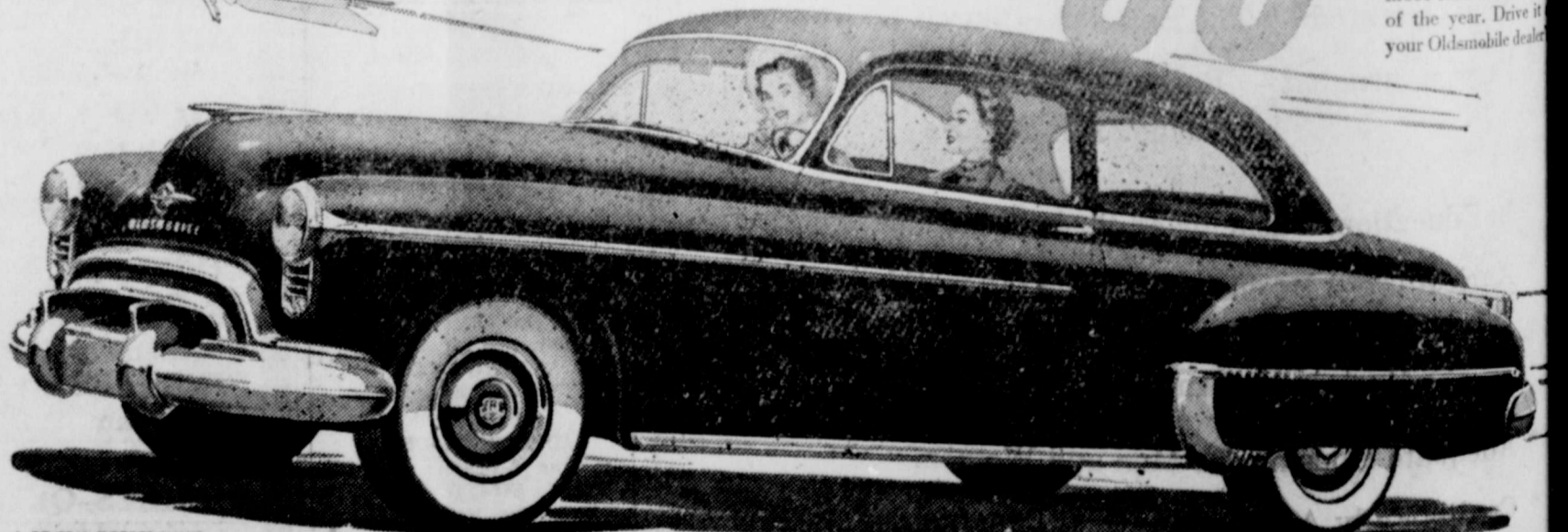
A GENERAL MOTORS VALUE