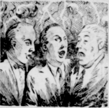
before Burns heard his "old man singing."