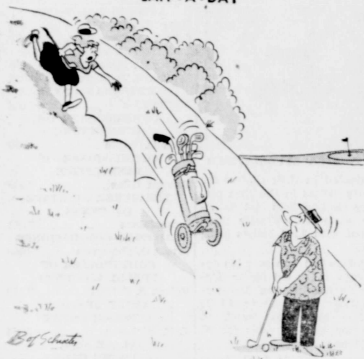
© 1954 THE KING FEATURES SYNDICATE, INC. ALL RIGHTS RESERVED