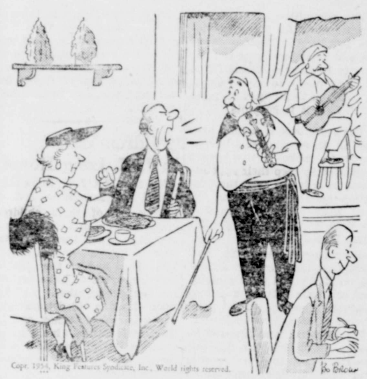
"Play something tender to this steak!"