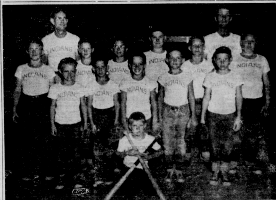
CHAMPIONS—Pictured here are the Mills County Little League Indians, with their managers and bat boy, who won the County championship title when they defeated Priddy in the final two out of three play-off. The contest ended last week Tuesday

Plans are underway for the opening of school as scheduled. All library work is completed including new shelving for the improved library. A librarian has not yet been selected but