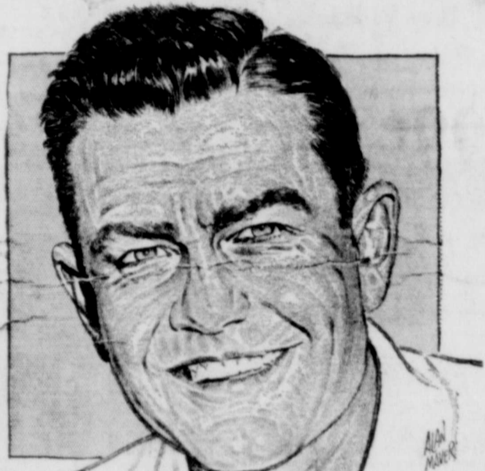
DARRELL ROYAL , OF TEXAS, ONCE MORE PROVING HIS TALENT FOR EFFECTING COMEBACKS—TOOK OVER AFTER WORST SEASON IN LONGHORN HISTORY AND IN ONLY HIS 3RD YEAR HAS TURNED OUT ONE OF NATION'S BEST.

A STRONG THREAT FOR CONFERENCE HONORS, THEY SHOULD STAY UP THERE FOR SOME TIME SINCE SOPHS HAVE BEEN PLAYING SUCH A LARGE PART IN THEIR SUCCESS.