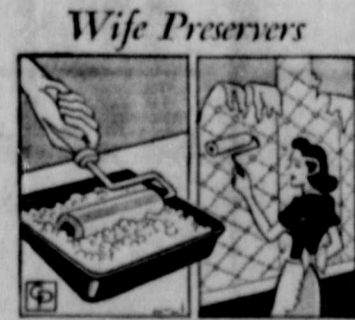
A point roller, covered with warm soap or detergent suds, can be used to remove wallpaper.