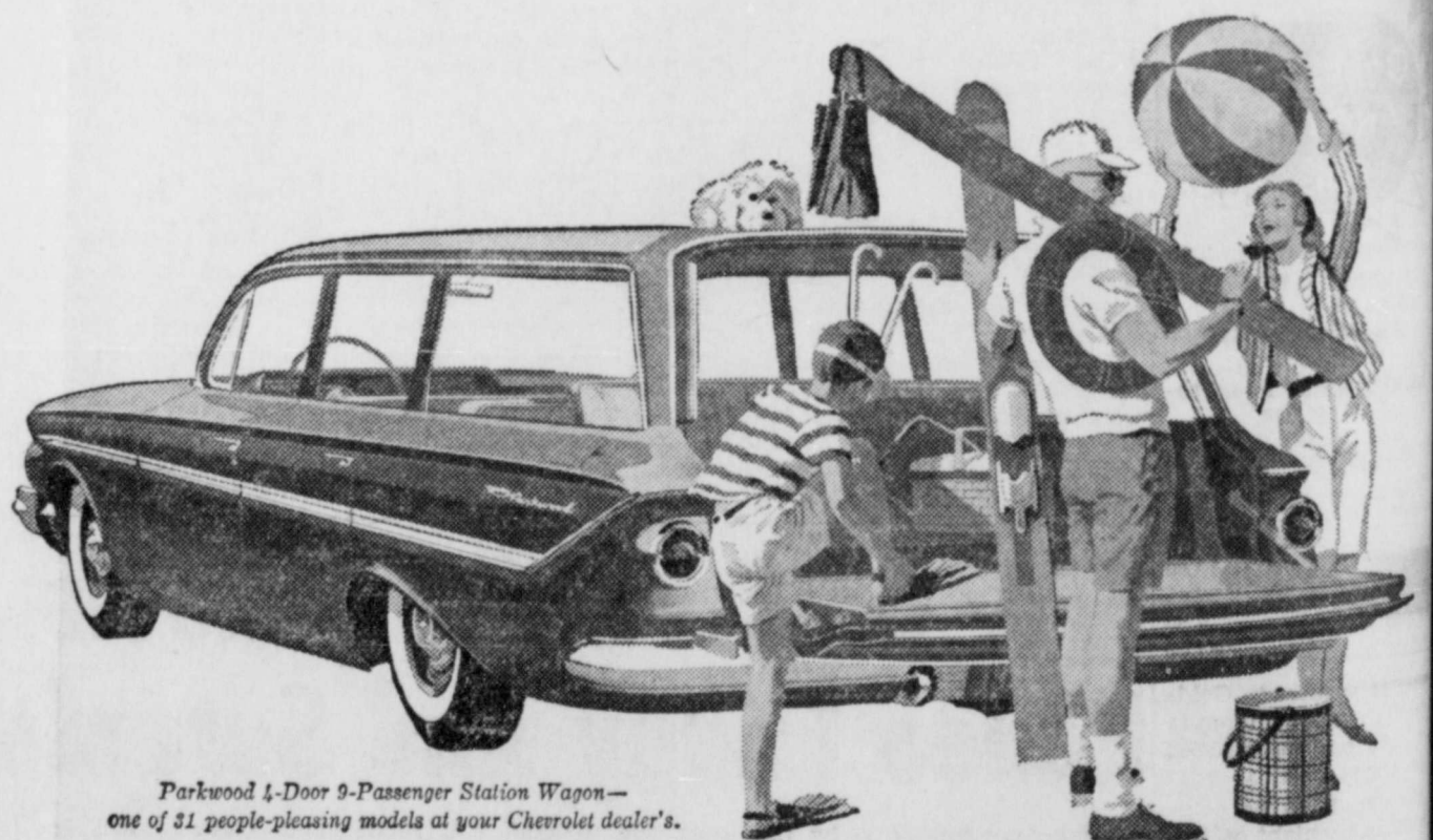
Parkwood 4-Door 9-Passenger Station Wagon— one of 31 people-pleasing models at your Chevrolet dealer's.

Dealers For International • Maytag • Whirlpool • Aermotor