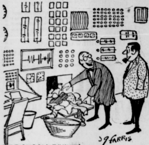
© 1961, King Features Syndicate, Inc. World rights reserved.