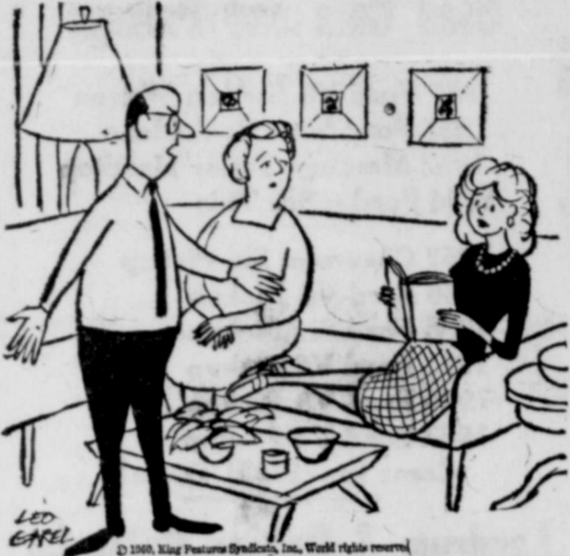
© 1960 King Features Syndicate, Inc. All rights reserved.