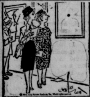
"It's one from a new school. The dot moves."