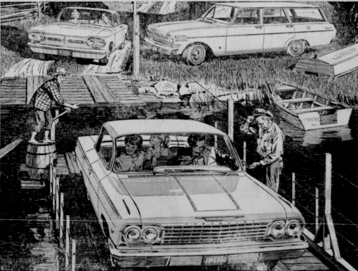
See the new Chevrolet, new Chevy II and new Corvaire at your local authorized Chevrolet dealer's

Corvaire If you spark to sporty things this one ought to fire you up but good. With the engine weight astern, the steering's as responsive as a bicycle's and the traction's ferocious. As for the seat—wow! At the ramp: the Monza Club Coupe.