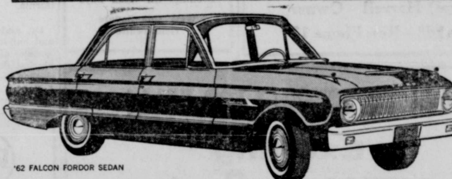
'62 FALCON FORDOR SEDAN

"I CAN LICK YOU AND YOUR KID BROTHER, TOO!"